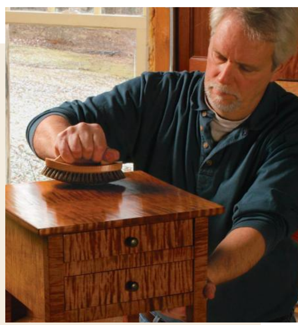
Not just for shoes. You can buff wax with a brush. This works well in carved areas and produces a slightly lower shine than a cloth.