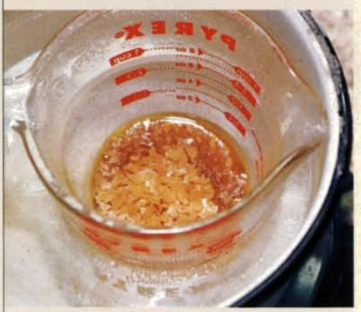
Use a shopmade double boiler to melt the wax. Most waxes will dissolve in turpentine. but it's faster to melt them (waxes used in polish melt between 145°F and 185°F). Place the wax in a heat-proof glass container, and put the container in a pot of hot water.