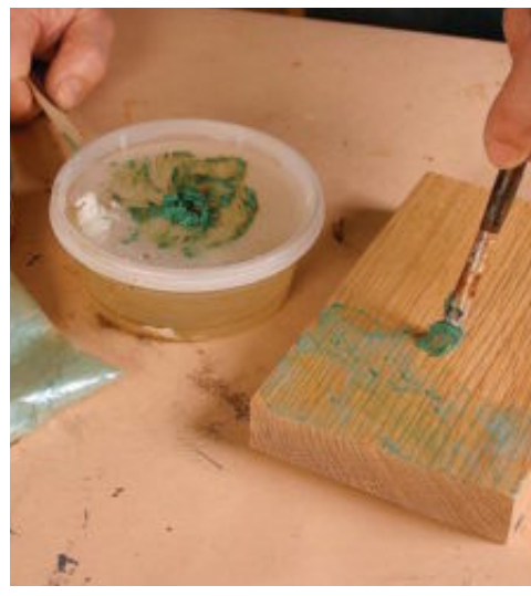
Color wax with powders. You can color clear wax by adding dry pigments or mica powders. Afterward, topcoat with either clear wax or shellac.