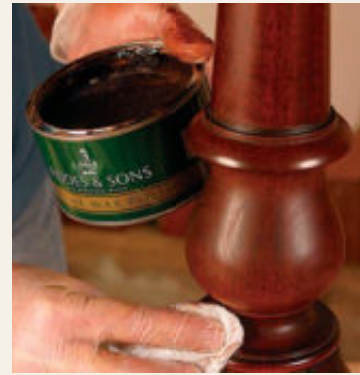
Buy the right color. Find one that matches the wood and it won't show in pores and recesses.

You can buy wax in a range of wood tones, or you can take clear paste wax and color it yourself. You must first melt the wax, but because wax is flammable, never heat it over an open flame. Instead, place it in a container over heated water, a device known as a double boiler. Add artist's oils or universal colorants and mix them in thoroughly. Let the wax solidify before use.