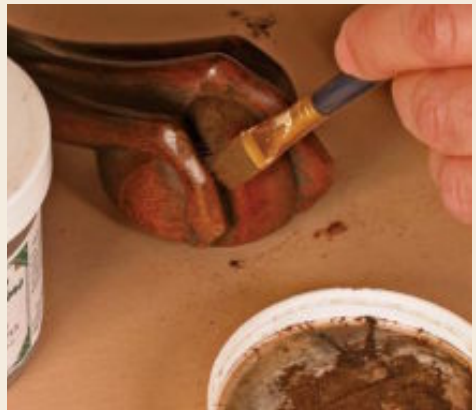
Simulate wax buildup. To replicate the dark recesses found on antiques, use dark wax in these areas (above), or apply dry pigments to freshly applied clear wax (center). When the wax is dry, burnish the high points with a cloth or a brush (below).