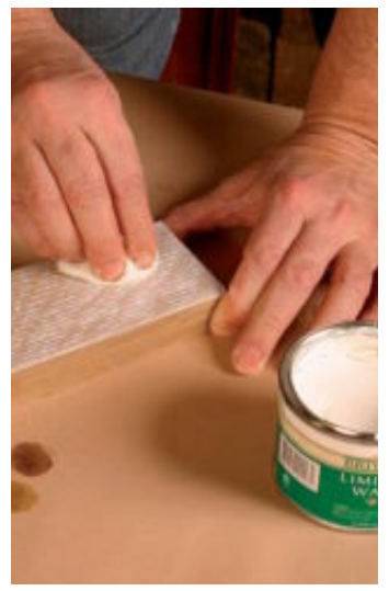
A limed finish. Fill the pores with white liming wax, and then remove the surplus. Later add a coat of clear wax, or for a higher gloss, a coat of shellac.