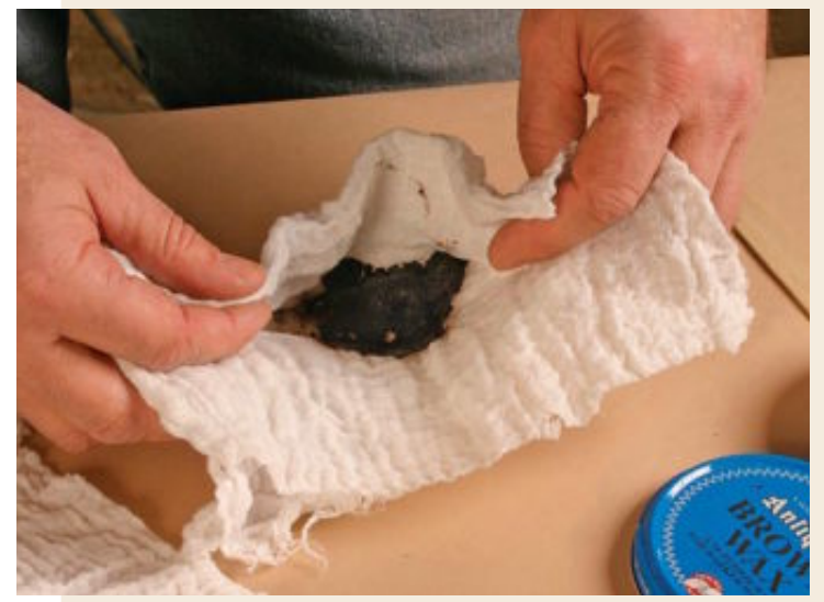
Create a wax applicator. Place some wax in the center of a double thickness of cheesecloth, gather the edges of the cloth together, and twist them closed.

rubbed-out shellac. The wax helps to even out the sheen and adds a measure of protection that can be renewed easily. However, don't be in a rush to apply it: Almost all waxes contain solvents, which can damage a film finish that isn't fully cured. For most finishes, this means waiting a week; but wait at least a month before applying a paste wax to solvent-based lacquer.