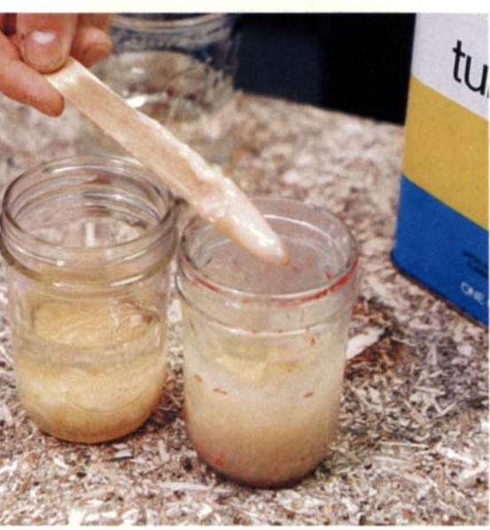
One of the oldest finishes around. A creamed beeswax polish, made by dissolving pure beeswax in turpentine (not mineral spirits), has been used on furniture for centuries.

Another solvent in wax is toluene. If you are making your own wax polish (see the story at right), you can do so without toluene, which is a strong solvent that can eat into finishes such as varnish if they are