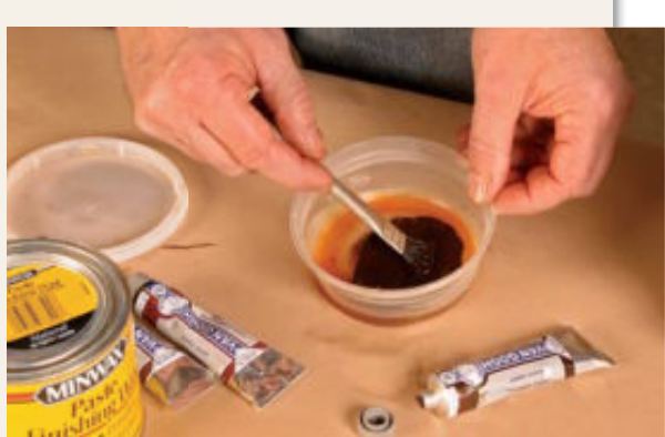
Or color your own. If you need only a small amount of colored wax or you want an unusual color, melt some clear paste wax in a container over hot water, and then mix in artist's oil colors.