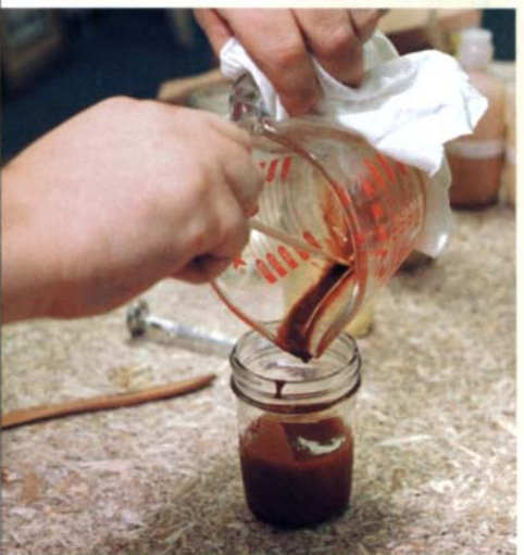
Add remaining ingredients to the melted wax. Before the wax cools and hardens, add the remaining ingredients, such as turpentine or pigment (top). Stir the mixture well, then pour it into a jar or a clean, pintsized paint can and allow it to cool (bottom).

As an alternative, you can make this recipe without heating the ingredients. Simply combine the beeswax shavings and turpentine in a jar, stirring occasionally. The beeswax should dissolve into the turpentine overnight. If it does not, add more turpentine very slowly.