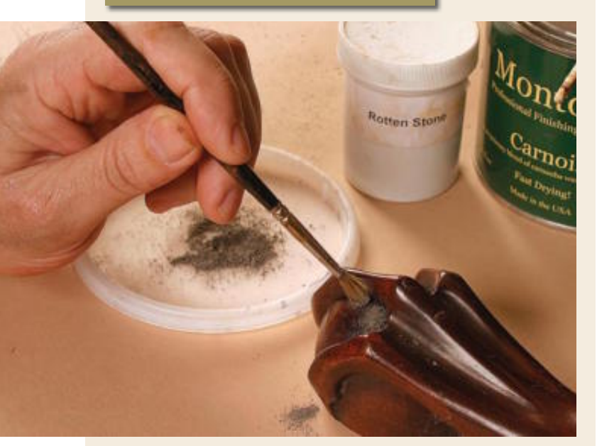
Dirt in the crevices. Apply softened paste wax into the nooks and crannies of carvings. Then tap in some rottenstone with a stiff-bristled brush (top). When the wax has dried, rub the area with crumpled newspaper to remove the bulk of the rottenstone, and then burnish the high points with a cloth (right). This leaves a line of gray similar to that found on antiques.