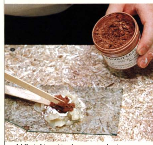
Adding pigment to clear wax works, too. If you don't want to go to the trouble of making your own wax, you can add pigment to any liquid or paste wax. You can use dry artist's pigments or mica powders (shown above). The author mixes the wax on glass, which is easy to clean.