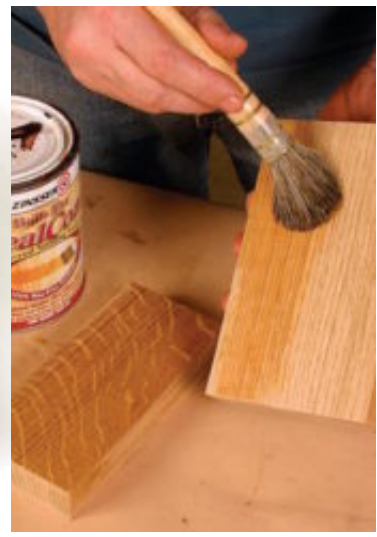
Prepare the wood. Open the pores by brushing the wood with a bronze or brass brush. After removing the dust with a vacuum or compressed air, apply a single coat of shellac.